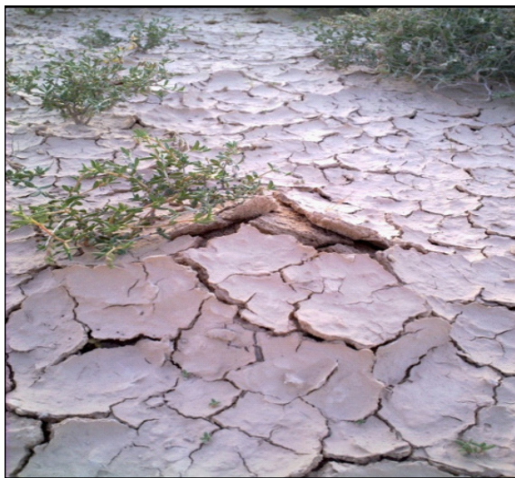
Figure 2. Tirmania nivea "Zubaidi" form mycorrhizas on roots of Helianthemum sp.